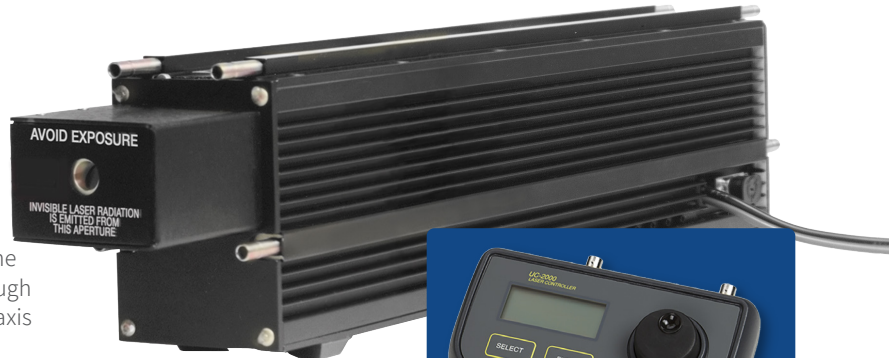
UC-2000 CO 2 Laser Controller Sold Separately

Performance of the system is typically \pm 2\% even when the laser line hops between 10.57 and 10.63 \mu\text{m} . This accuracy is achieved by a combination of a wavelength insensitive beamsplitter and assured linear polarization of the signal impinging on the beamsplitter. The beamsplitter is a 45° oriented disc of ZnSe, AR coated on one side only. The optical input is provided through a Brewster angle polarizer, removing any residual orthogonally polarized components. The uncoated side of the ZnSe beamsplitter provides a wavelength independent signal used as sample input. Spatial non-uniformities of the beam are removed by reflecting the sampled signal from a metal grid diffuser before entering the broadband detector. The sampling detector has no window and has a flat black coating.