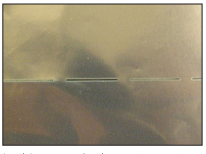
In this example the center cut goes completely through the thin film, while the other cuts did not penetrate through.