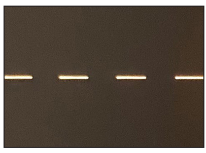
In this example the thin film was cut using a Synrad vi30+, yielding clean, consistent cuts.